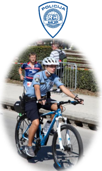
PROTECT YOUR BICYCLE

POLICIJSKA UPRAVA ISTARSKA Trg Republike 1, 52 100 Pula e-mail: istarska@policija.hr POLICIJSKA POSTAJA PULA-POLA Trg Republike 1, 52 100 Pula POLICIJSKA POSTAJA UMAG-UMAGO S ISPOSTAVOM BUJE-BUIE Jadranska 11, 52 470 Umag POLICIJSKA POSTAJA LABIN Istarska 1, 52 220 Labin POLICIJSKA POSTAJA PAZIN S ISPOSTAVOM BUZET Muntriljska 2, 52 000 Pazin POLICIJSKA POSTAJA POREČ-PARENZO Gimnastička 2, 52 440 Poreč POLICIJSKA POSTAJA ROVINJ-ROVIGNO Istarska 13, 52 210 Rovinj POLICIJA/POLICE/POLIZEI 192