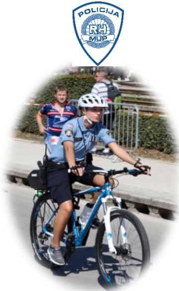
PROTECT YOUR BICYCLE

POLICIJSKA UPRAVA ISTARSKA Trg Republike 1, 52 100 Pula e-mail: istarska@policija.hr POLICIJSKA POSTAJA PULA-POLA Trg Republike 1, 52 100 Pula POLICIJSKA POSTAJA UMAG-UMAGO S ISPOSTAVOM BUJE-BUIE Jadranska 11, 52 470 Umag POLICIJSKA POSTAJA LABIN Istarska 1, 52 220 Labin POLICIJSKA POSTAJA PAZIN S ISPOSTAVOM BUZET Muntriljska 2, 52 000 Pazin POLICIJSKA POSTAJA POREČ-PARENZO Gimnastička 2, 52 440 Poreč POLICIJSKA POSTAJA ROVINJ-ROVIGNO Istarska 13, 52 210 Rovinj POLICIJA/POLICE/POLIZEI 192